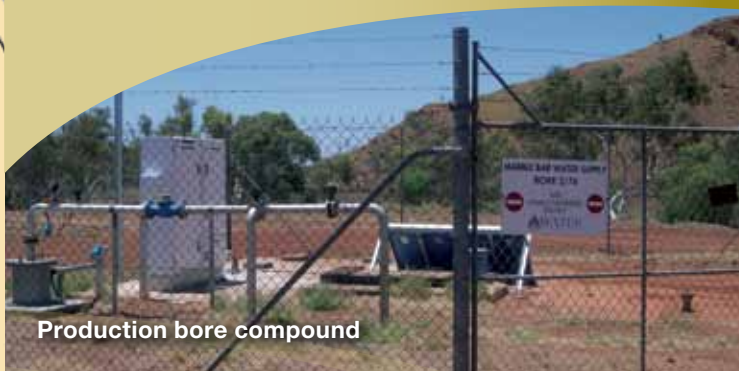
Production bore compound

New developments, or expansion of existing land uses or activities will need to consider the priority areas, protection zones and recommendations in the Marble Bar Water Reserve drinking water source protection plan and our Water quality protection note no. 25: Land use compatibility in public drinking water source areas .