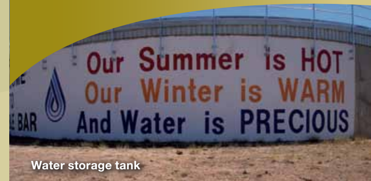
Water storage tank