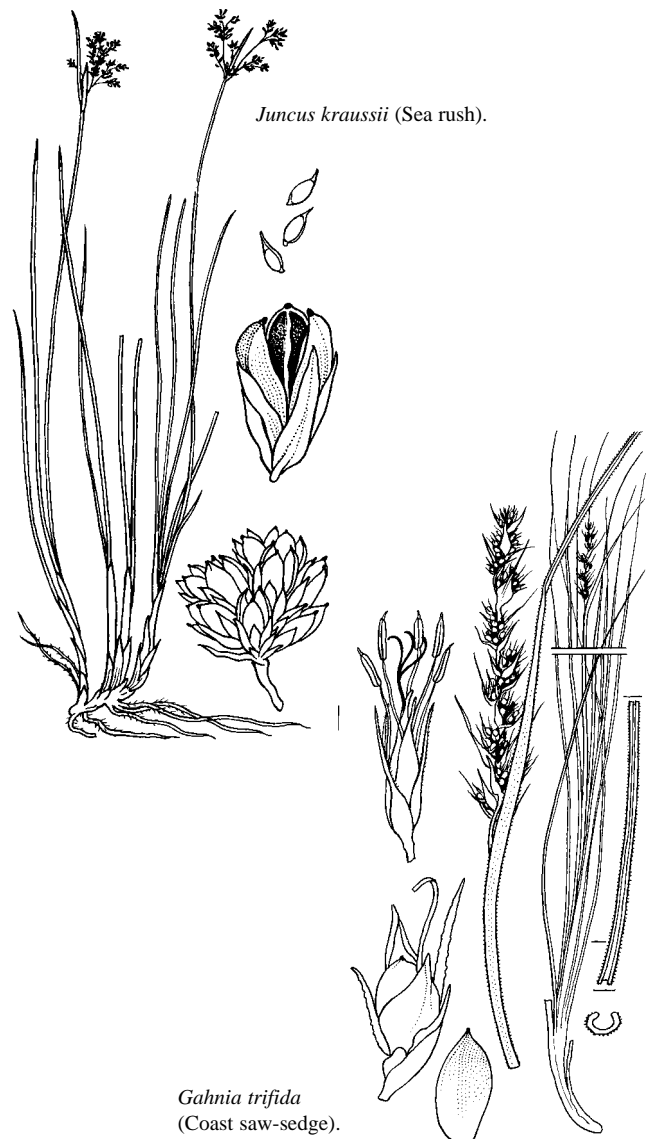
Juncus kraussii (Sea rush).

When planted in dense stands, native rushes and sedges are excellent for weed control, excluding less desirable species and out-competing others. This is particularly important in the wheatbelt where many saline watercourses are being colonised by the exotic spiny rush, Juncus acutus . This species should be replaced with appropriate native analogues, such as Juncus kraussii and Gahnia trifida . A list of suitable species for planting in a wide range of conditions is given in Table 1.