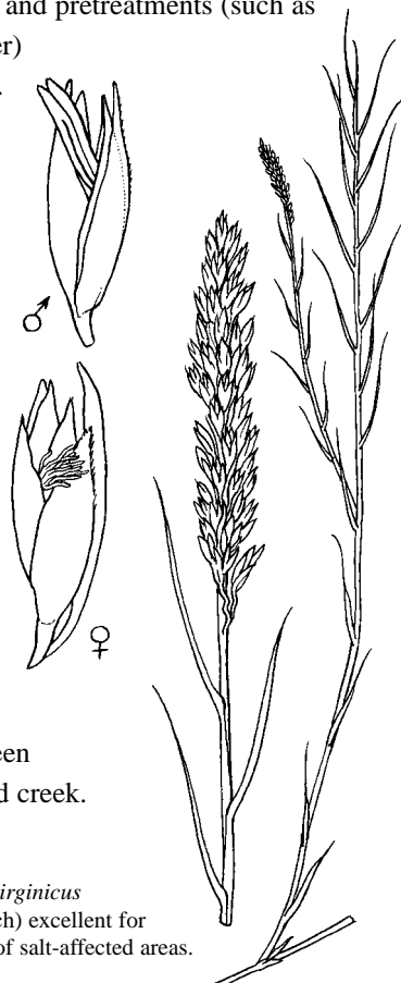
Sporobolus virginicus (Marine couch) excellent for reclamation of salt-affected areas.

Matgrass ( Hemarthria uncinata ), is common along creeklines, withstanding brackish conditions. This species and Weeping grass ( Microlaena stipoides ) both have a rhizomatous habit and are excellent for erosion control. Because of their palatability, they are good species to use in grazed transitional zones between paddocks and the fenced creek.