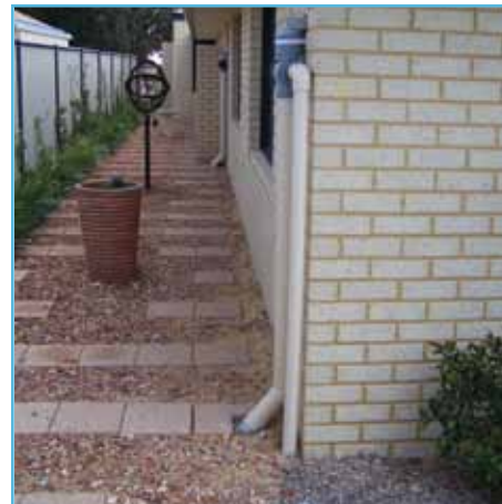
Pervious aggregate placed around impervious pavers