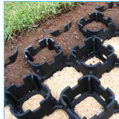
Grass paver system