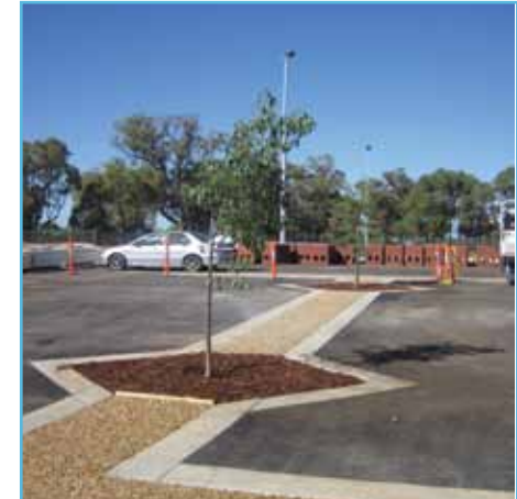
Pervious paving carpark retrofit, Mandurah