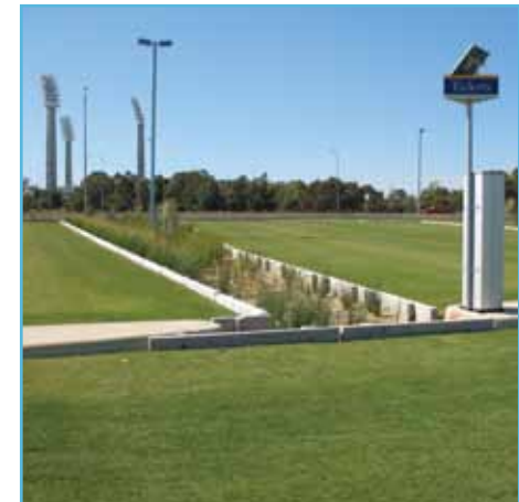
Point Fraser turf car park