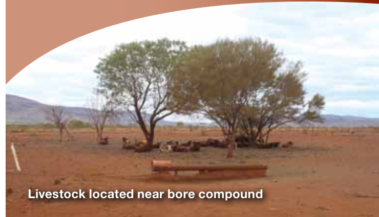
Livestock located near bore compound