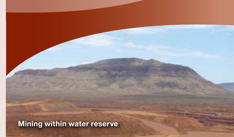
Mining within water reserve