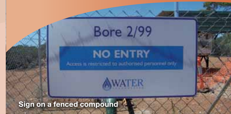
Sign on a fenced compound