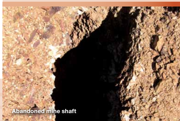
Abandoned mine shaft