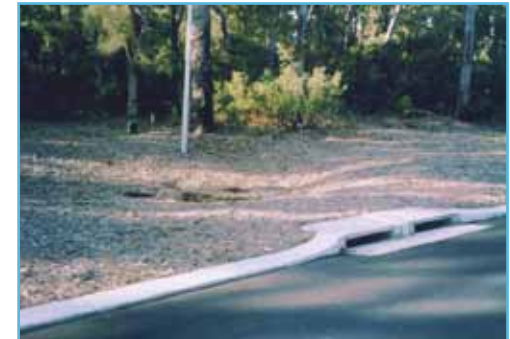
Completion, Boronia Ridge, Walpole