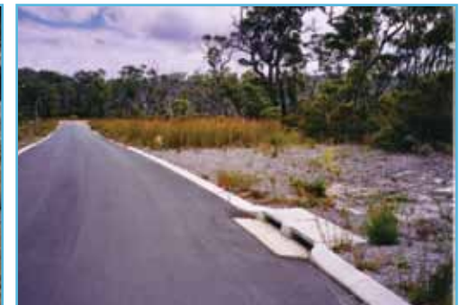
Completion, Boronia Ridge, Walpole