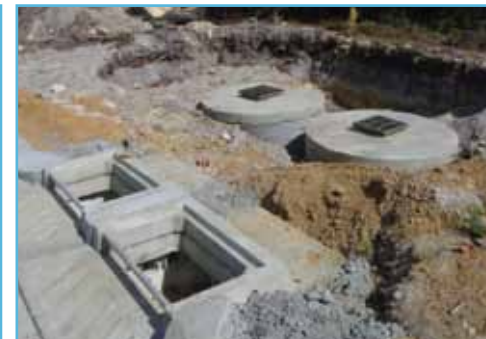
Installation, Boronia Ridge, Walpole