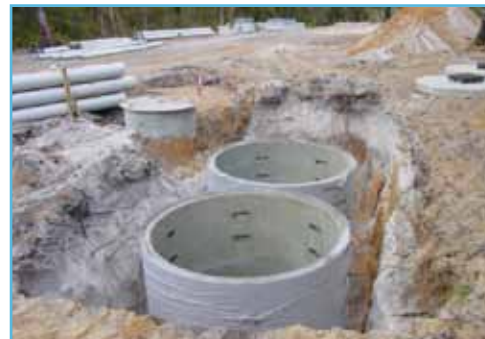
Installation, Boronia Ridge, Walpole